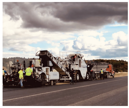
"Goodbye old runway!" Second full day of work. Wednesda,y September 8, 2021 - "The Continental Army" at work. Paving begins, Friday, October 22, 2021