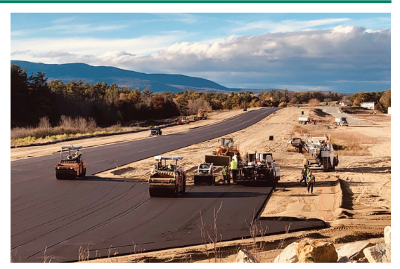
A new runway is born