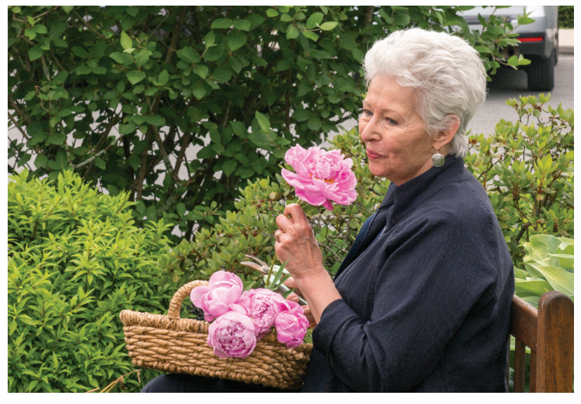
The joy of independence coupled with the comfort of personal security.