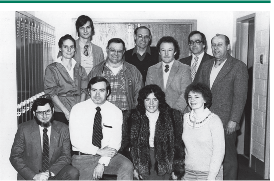
Thank you all for what you've done for the Chamber, what you are doing for the Chamber and for what you will do for the Chamber. *Respectfully submitted with pride*,