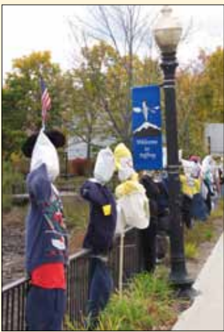
TEAM Jaffrey's Scarecrows on the Common had a record 318 crows built this year!

7 Main Street • PO Box 2 • Jaffrey, NH 03452 • 603-532-4549 • Fax 603-532-8823 • www.jaffreychamber.com