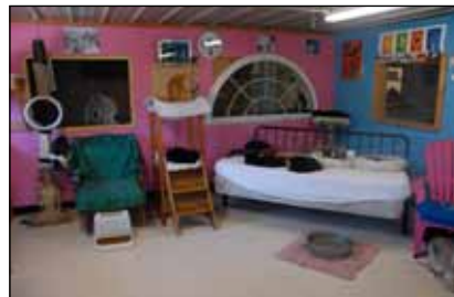
One of Kitty Rescue's seven cage-free rooms.