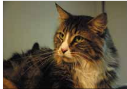
Gilbert finds a new home!

With an eye towards sustaining this momentum, Kitty Rescue & Adoption, a privately funded by donation 501(C)3 non-profit managed entirely by volunteers, has begun a