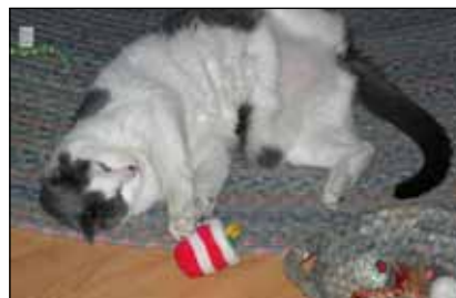
Daisy settles in.