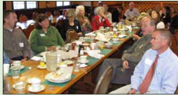
Once again, the Inn at East Hill Farm delivered a fantastic breakfast for Chamber members.