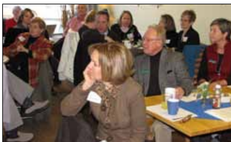
April - Breakfast at Sunflowers.