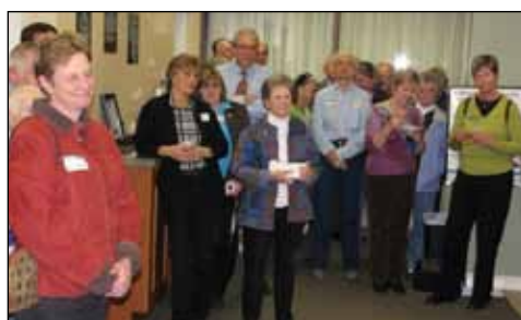
November - After Hours at Monadnock Community Bank with co-host Monadnock Handcrafted Wooden Toys.