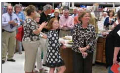
September - After Hours at Belletetes.