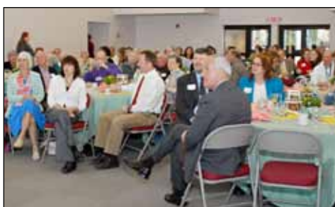
April - Joint Chambers Breakfast at Franklin Pierce University