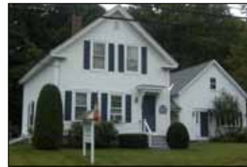
Contoocook Valley Insurance Antrim Office

Bellows-Nichols Agency is acquiring the Contoocook Valley Insurance Agency in Antrim as of May 1.