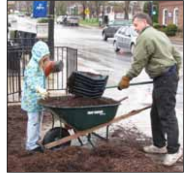
A little rain didn't dampen the enthusiasm of those who helped out with downtown and roadside clean-up efforts on April 24.

to a parent's ability to pay based on their income. To support such a scholarship program, the Center must seek financial assistance beyond monies received from the State and Monadnock United Way through community events and an annual contribution appeal.