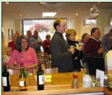
It was standing room only at the April After Hours!