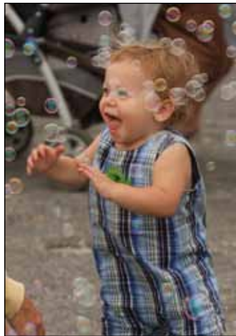
There's always something to do while waiting for the fireworks to begin! Watching the sky-diving exhibition, getting some yummy snacks from the vendors or just blowing some good old-fashioned bubbles!